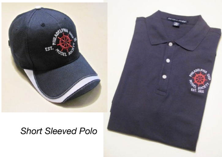
Short Sleeved Polo