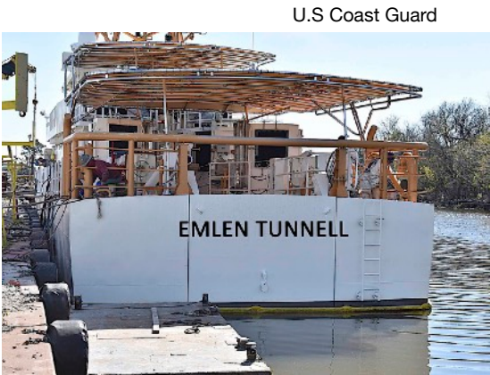
U.S Coast Guard