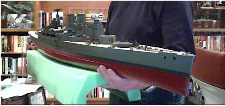
HMS HOOD British Battleship Circa WWII Scale 1/200 51" long