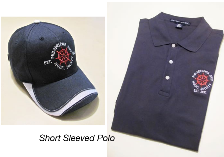
Short Sleeved Polo