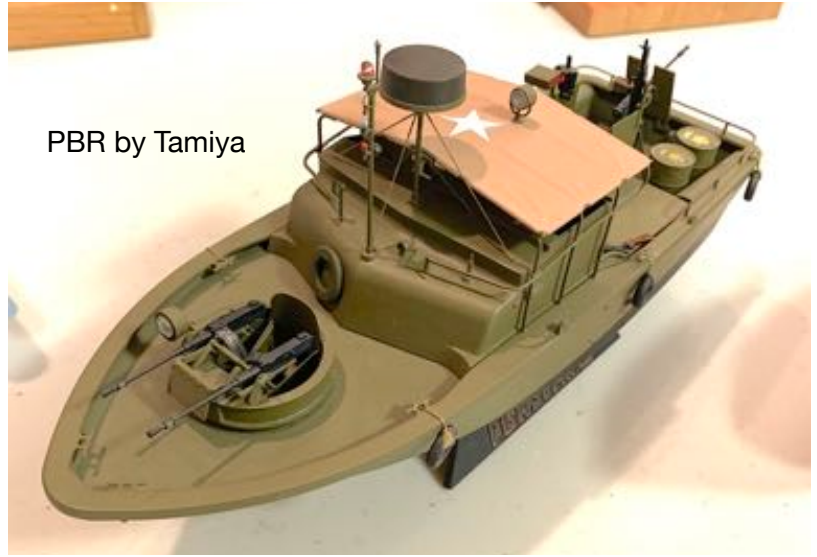
PBR by Tamiya