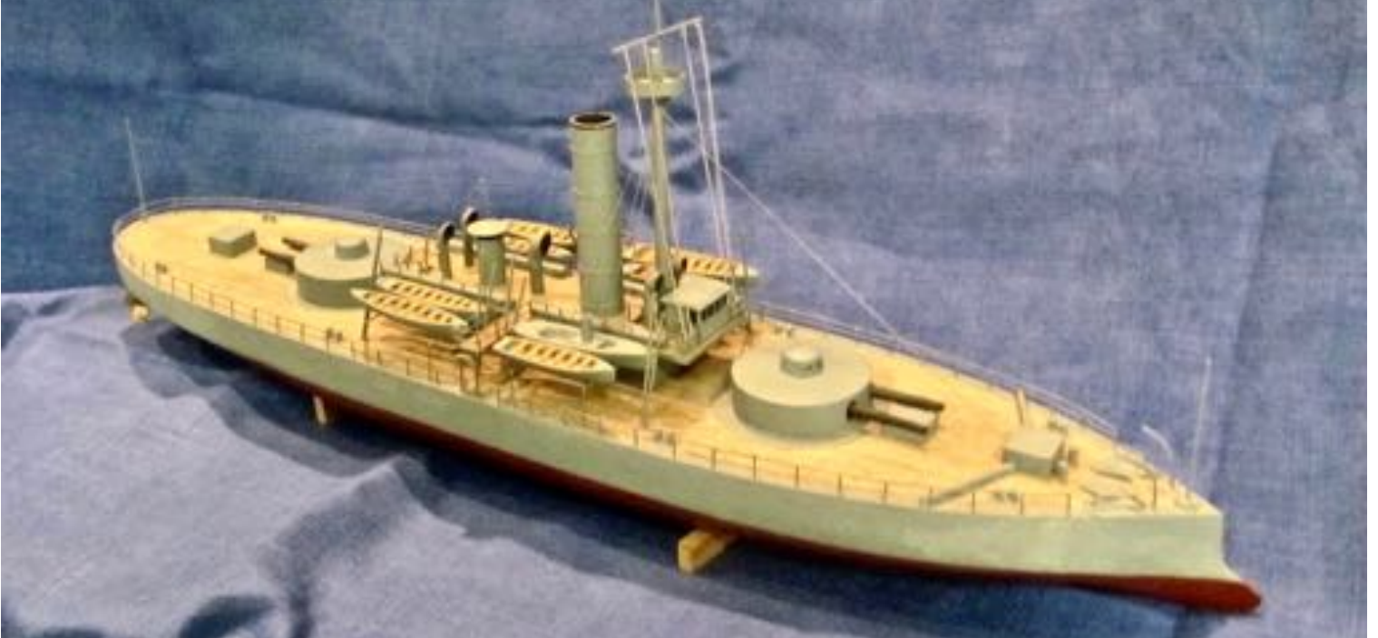
USS MIANTONOMOH (BM-5) Monitor