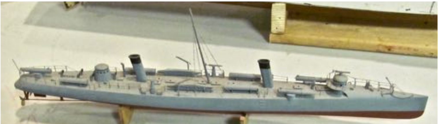
USS WINDSLOW (TB-5) Torpedo Boat

Launched in 1876, she was an iron hulled . twin screw, double-turreted monitor. Fought in the Spanish/American war and decommissioned in 1907.