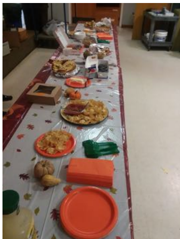
Refreshments and plates and napkins set out for the break in Halloween colors thanks to Pat Leaf