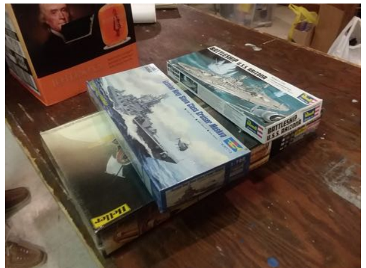
Right; Model kits- some unopened.