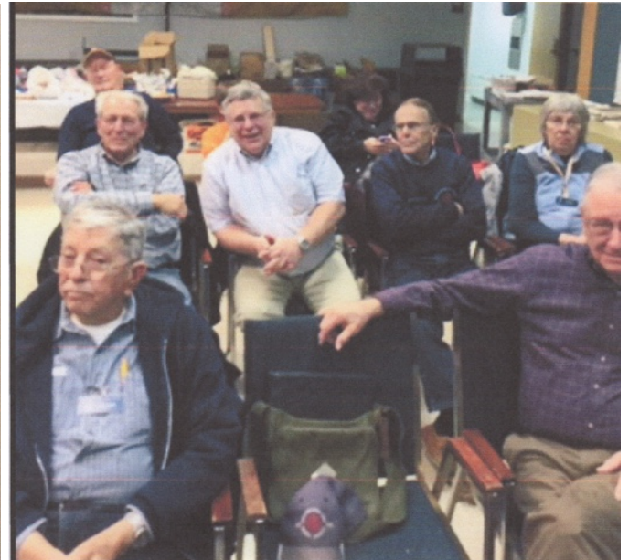
.....and a good time was had by all ! See you next month.

Hope to see you at the NE Ship Model Conference and Show April 29th, See page 6