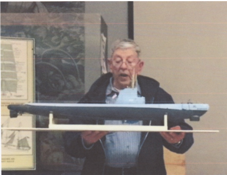
RON SPICER - 1/96 scale model of USS Becuna, a Guppy Class post WWII submarine. Scratch built, plank on bulkhead.