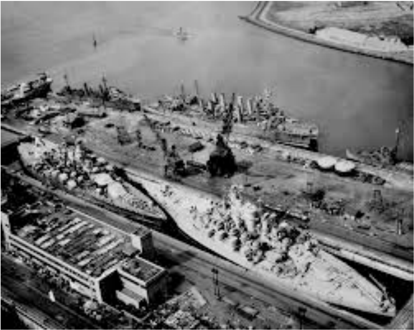
A photo of the Battleships Tennessee BB-43 and California BB-44 in drydock #5 at the Philadelphia Navy Yard. The photo was taken between May and October 1946 prior to scrapping. All of the ships in this photograph were destined for scrapping except for the dark two stack ship in the upper left. That's the USS Olympia.