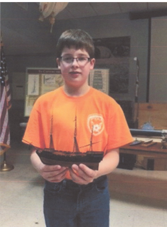
DONNIE FRENZEL - Black diamond three masted frigate model